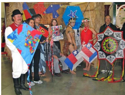
The World Kite held by the kite runner who opened the Children's Showcase. This kite is followed by some of the kites displayed in the exhibit - Kites: Our Roots and Wings. The kites are held by their ethnic representatives from left to right - Brazil, Japan, India, Korea, Chile (Easter Island), Turkey, Taiwan and the fighter kites above from the Philippines.

A kite, a sky, a firm breeze and hundreds of yards of string!